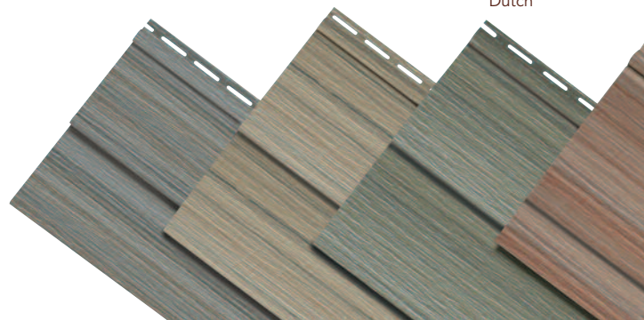
Double 5" Dutch